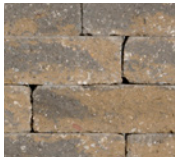
● Ashen buff