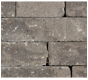
● Gray and charcoal