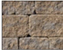
Beige and Charcoal

NOTE: We recommend that you use actual samples to make your final choice.