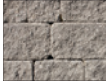
Gray and Charcoal