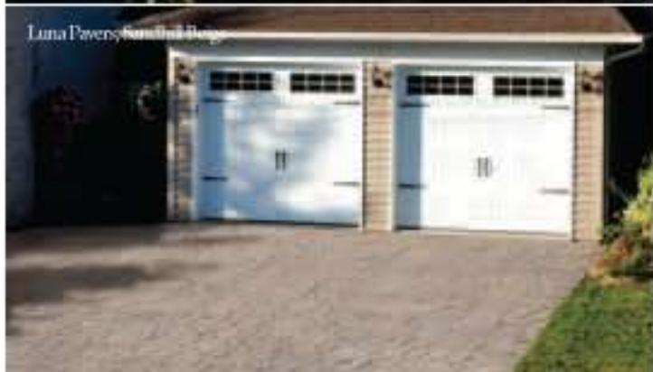
Luna Pavers, Sandhill Beige