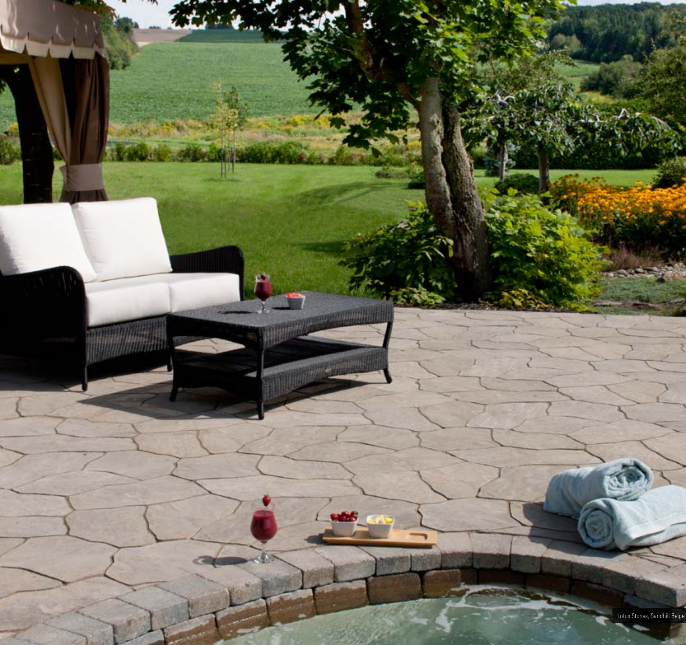
Lotus Stones, Sandhill Beige