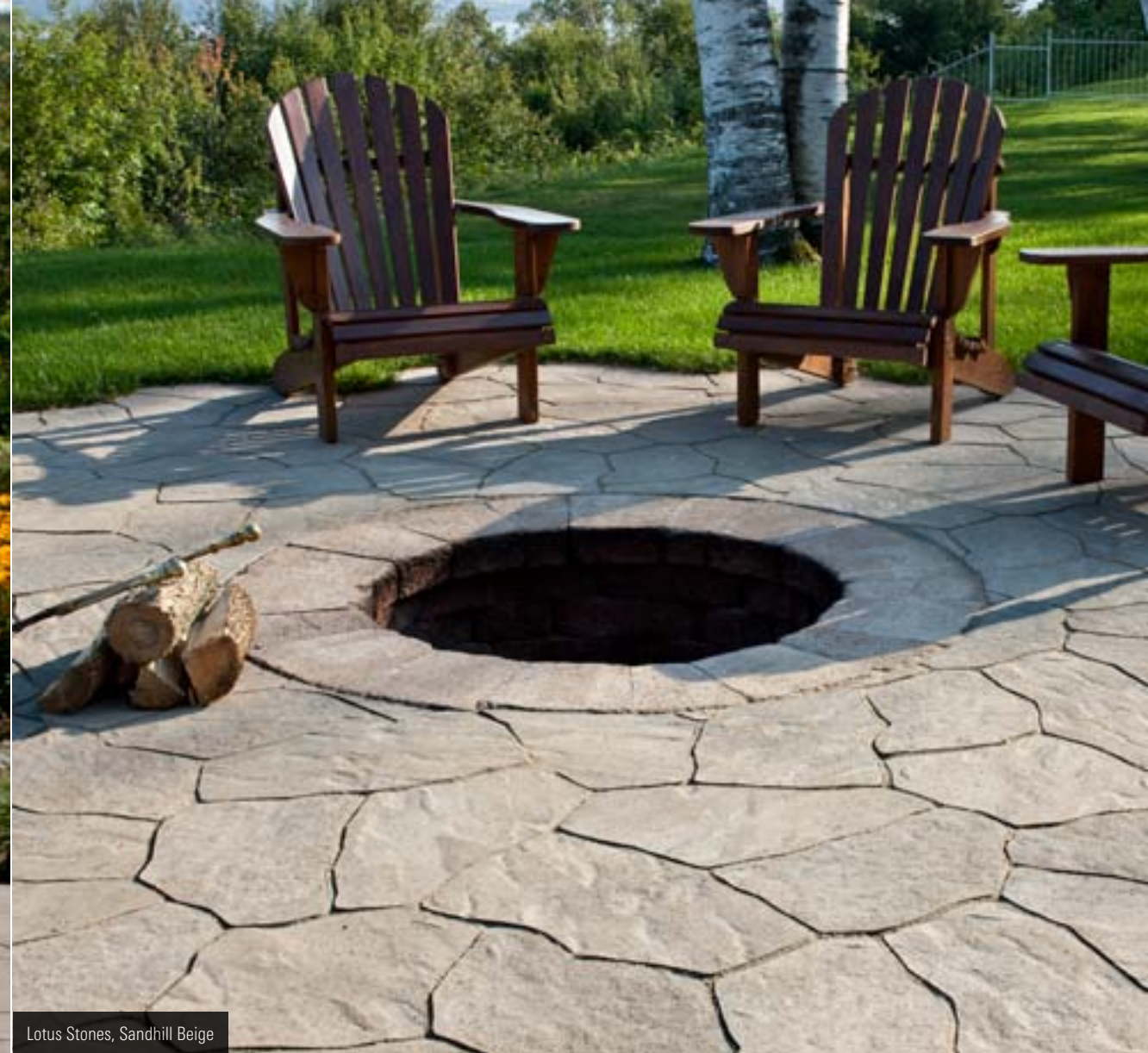
Lotus Stones, Sandhill Beige