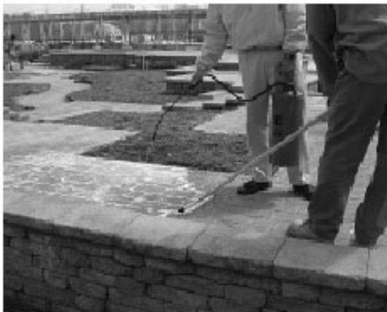
Figure 3. This liquid joint sand stabilizer is applied with a low-pressure sprayer and squeegeed across the surface after allowing some time for soaking into the joints. This helps maintain slip and skid resistance of the paver surface.

Stabilizer and sealers are two distinct products sometimes with overlapping functions. Joint sand stabilizers help secure sand in the joint after it has been installed. Their primary function reduces the risk of removal of joint sand from flowing water, wind, aggressive cleaning, tire action and intrusion of organic matter, seeds and ants. Joint sand stabilizers come in liquid and dry applied forms. Some liquid stabilizers are made of the same materials as sealers, but with a higher solids content with additional wetting agents. When applied to the paver surface and joints, stabilizers can make the surface easier to clean and prevent staining in a manner similar to sealers. Depending on the chemical contents, liquid stabilizers may or may not change the appearance of the paver surface. All surface sealers are applied as liquids. Their primary function is providing additional protection to concrete paver surfaces. Such chemicals can be similar to products used to seal cast-in-place concrete slabs. Sealers are applied to the entire surface of an installation to add further protection from stains, oils, dirt, or water. Occasionally, sealers are applied to pavers during manufacturing. Whether applied in a factory or on a site, most sealers change the appearance of the paver surface by darkening it and enhancing the surface color. Since liquid sealers penetrate the joint sand to some extent during application, they secondarily provide some stabilization.