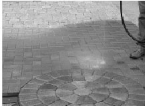
Figure 7. Dry-applied joint sand with a stabilizer is wetted in order to activate it and stiffen the sand. Once the joints dry, they are stabilized.