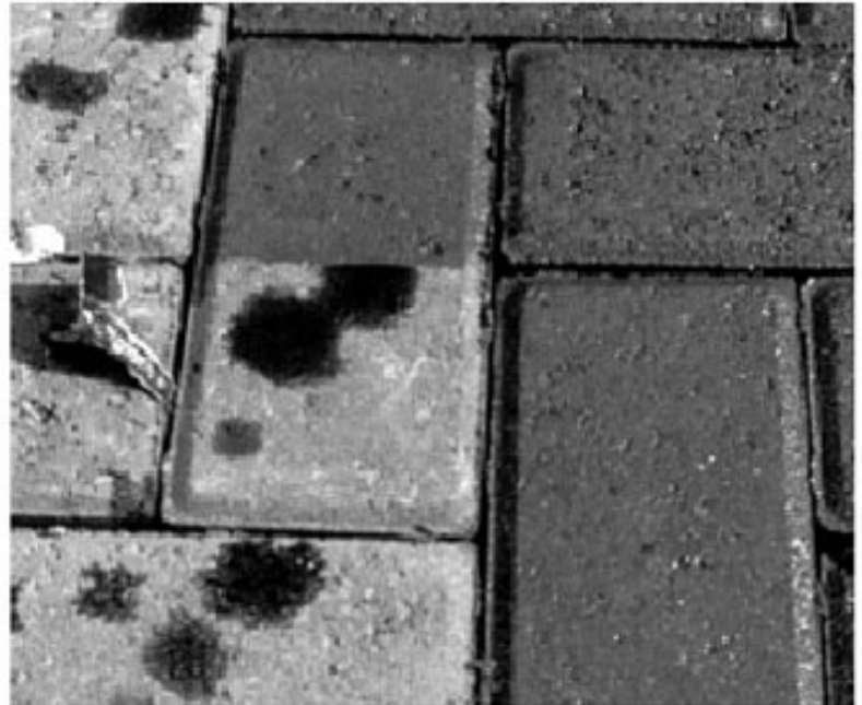
Figure 9. Sealers resist stains which makes them ideal for high use areas where they might occur.