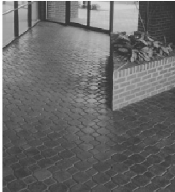
Figure 1. Many sealers enhance the appearance of concrete pavers and protect against staining.

When properly installed, interlocking concrete pavements have very low maintenance and provide an attractive surface for decades. Under foot and vehicular traffic, they can become exposed to dirt, stains and wear. This is common to all pavements. This technical bulletin addresses various steps to ensure the durability of interlocking concrete pavements and to help restore their original appearance. These steps include removing stains and cleaning, plus joint stabilization or sealing if required. Stains on specific areas should be removed first. A cleaner should be used next to remove any efflorescence and dirt from the entire pavement. A newly cleaned pavement can be an opportune time to apply joint sand stabilizers or seal it. In order to achieve maximum results, use stain removers, cleaners, joint sand stabilizers, and sealers specifically for concrete pavers. These may be purchased from a manufacturer, contractor, dealer or associate member of the Interlocking Concrete Pavement Institute.