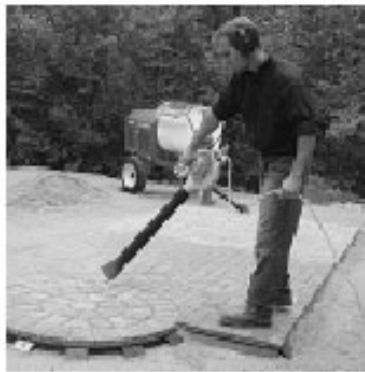
Figure 6. Whether using liquid or dry joint stabilization materials, the surface of the pavers should be cleaned with a blower or broom after the joint sand is compacted into the joints.