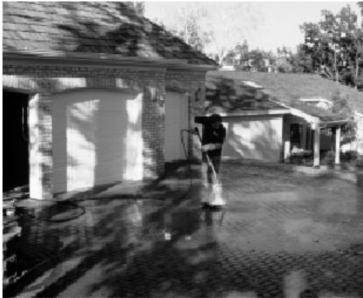
Figure 2. Pressurized cleaning equipment used by professional cleaning and sealing companies can bring out the best appearance from pavers.