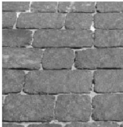
Figure 4. Liquid joint sand stabilizers can deepen the surface color slightly and they provide some surface sealing as well. Tumbled pavers shown here have wider joints than other shapes. These type of pavers can require stabilization of the joint sand.