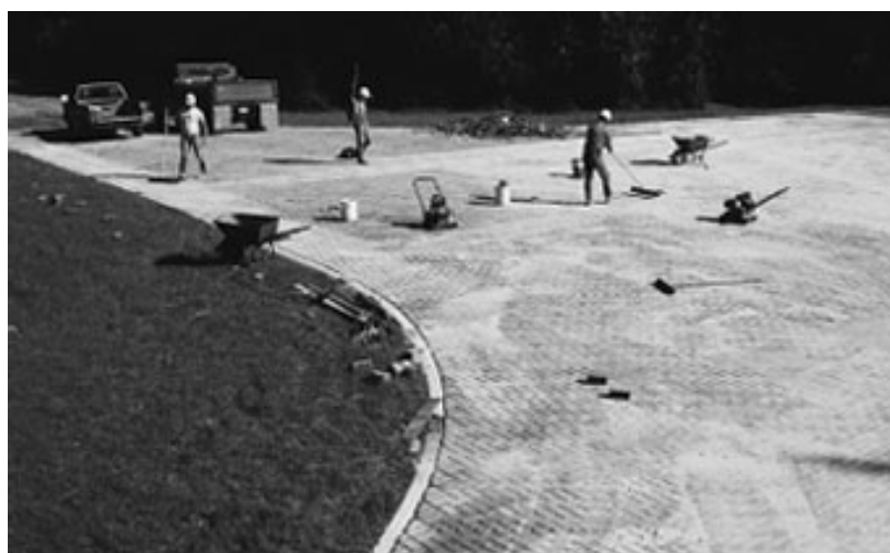
Figure 12. Excess sand swept from the finished surface will make the pavement ready for traffic.