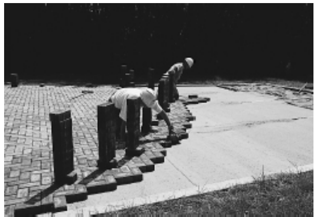
Figure 7. Placing the concrete pavers.