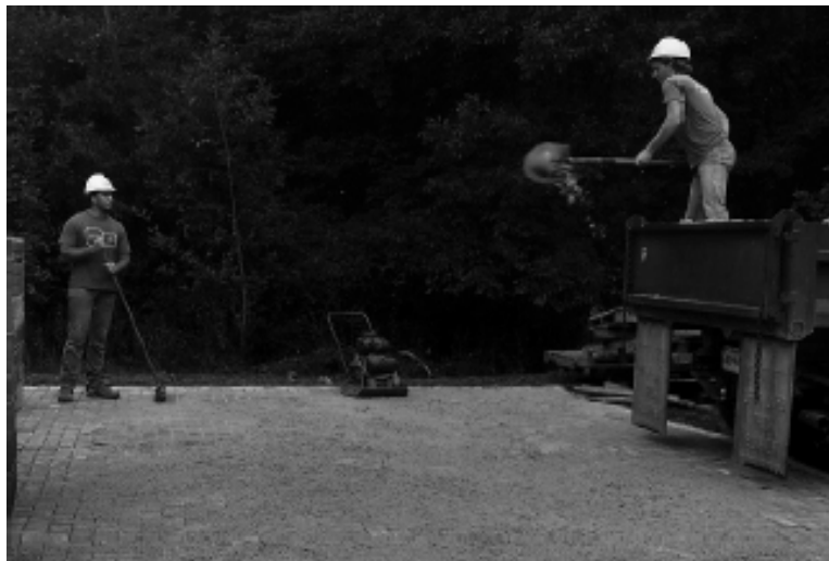
Figure 10. Spreading and sweeping joint sand.