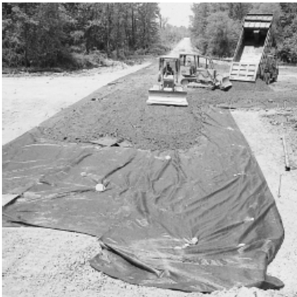
Figure 3. Application of the geotextile under aggregate base.