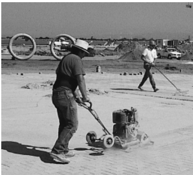
Figure 11. Vibrating sand into the joints.