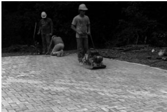
Figure 9. Compacting the pavers and bedding sand.

50 ft (15 m) from taut string lines. The top of the pavers should be 1 / 8 to 3 / 8 in. (3 to 10 mm) above adjacent catch basins, utility covers, or drain channels, with the exception of areas required to meet ADA design guideline tolerances. The top of the installed pavers may be 1 / 8 to 1 / 4 in. (3 to 6 mm) above the final elevations to compensate for possible minor settling. A small amount of settling is typical of all flexible pavements. Optional sealers or joint sand stabilizers may be applied. See ICPI Tech Spec 5-Cleaning, Sealing and Joint Sand Stabilization of Interlocking Concrete Pavement for further guidance. ICPI Tech Spec 9-A Guide Specification for the Construction of Interlocking Concrete Pavement helps translate construction methods and procedures described here into a construction document. Tech Spec 9 provides a template for developing project-specific materials and installation specifications for the bedding and joint sand, plus the concrete pavers. Additional guide specifications and detail drawings for various applications are available at www.icpi.org as well as ICPI Tech Specs. Other ICPI Tech Specs and technical manuals should be referenced for information on design, detailing, construction and maintenance.