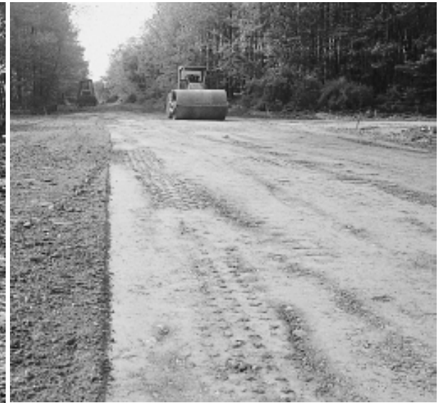
Figure 2. Compacting the soil subgrade.