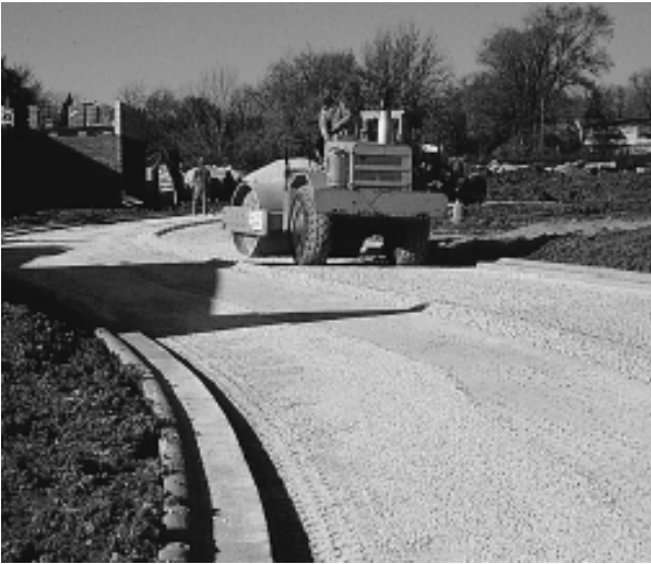
Figure 4. Base compaction with a vibratory roller.

edge restraints for recommendations on applications and construction. Edge restraints must be set at the correct level, especially if the tops of the restraints are used for screeding the bedding sand. Their elevations should be checked prior to placing the sand and pavers. Edge restraints are typically installed before the bedding sand and pavers are laid. However, some restraints can be secured into the base as the laying progresses.