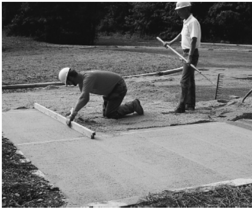
Figure 6. Screeding the bedding sand.