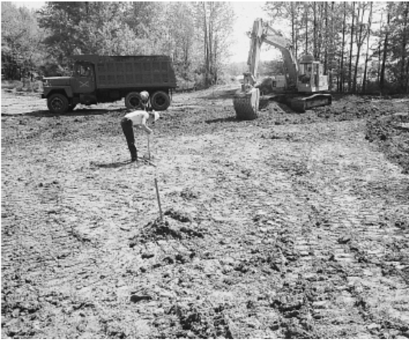
Figure 1. Excavation of the soil subgrade.