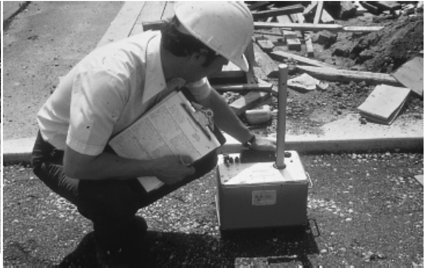
Figure 5. Density testing of the aggregate base with a nuclear density gauge.