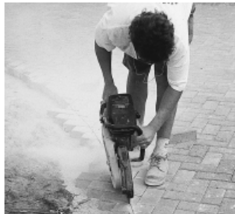
Figure 8. Saw cutting pavers.