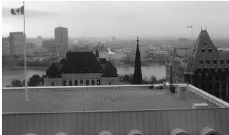
Figure 5. Light colored paving on low-slope roofs reflects light saving on air-conditioning costs while protecting the waterproofing.