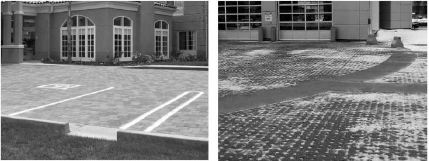
Figure 2. Examples of permeable interlocking concrete pavements for earning LEED® points. The photo on the left shows a hotel entrance in southern California. The photo on the right shows the driveway and parking lot for a fire station in Toronto.

An in-depth presentation of design, specification, construction and maintenance is found in the ICPI publication, Permeable Interlocking Concrete Pavements (ICPI 2000) . Most PICP will infiltrate runoff falling directly on it from 80% to 90% of all storms. The infiltration rate of the soil, base thickness (reservoir capacity) and any runoff from contributing areas will determine if PICP qualifies for reducing the peak discharge to the pre-development one and two year, 24 hour peak discharge rate. In most cases PICP will meet this requirement. Pavement infiltration rates are a function of several factors including permeability of the fill material for the surface openings and for the base materials. No. 8 stone typically used in the openings has an infiltration rate exceeding 500 in./hr (12.7 m/hr). Infiltration rates of Nos. 57 and 2 stone used for the base and sub-base exceed 1,000 in./hr (25 m/hr). Over time, the voids in these materials can become clogged, especially around the stone in the surface openings. Nearby sources of sediment can typically run onto the pavement. Periodic maintenance with vacuum sweeping will help maintain high surface infiltration rates. Research has shown that high infiltration rates can be maintained by removing the sediment in the first inch (25 mm) of the openings (Gerrits 2002).