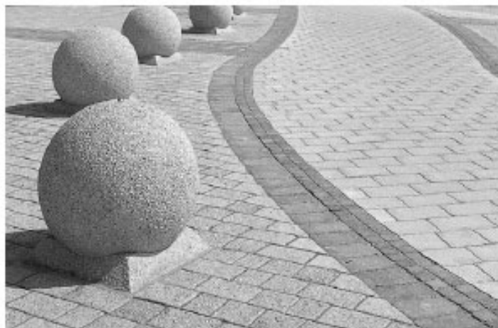
Figure 4. Light colored paving units reflect light and help reduce micro-climatic temperatures.

regularly. Grids and grass will provide heat reducing benefits for these areas. Areas with regular parking should be paved with PICP.