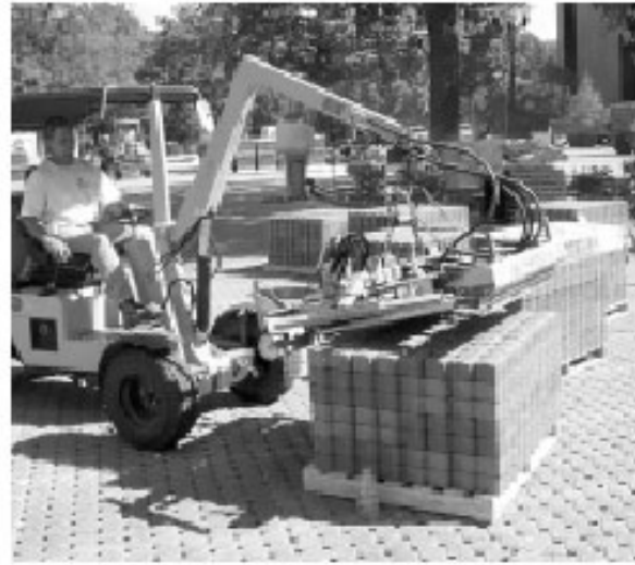
Figure 1. Mechanical installation of interlocking concrete pavements (left) and permeable units (right) is seeing increased use in industrial, port, and commercial paving projects to increase efficiency and safety.