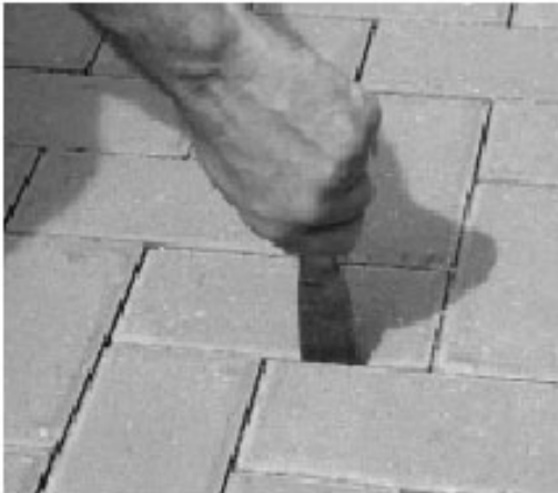
Figure 13. A simple test with a putty knife checks consolidation of the joint sand.