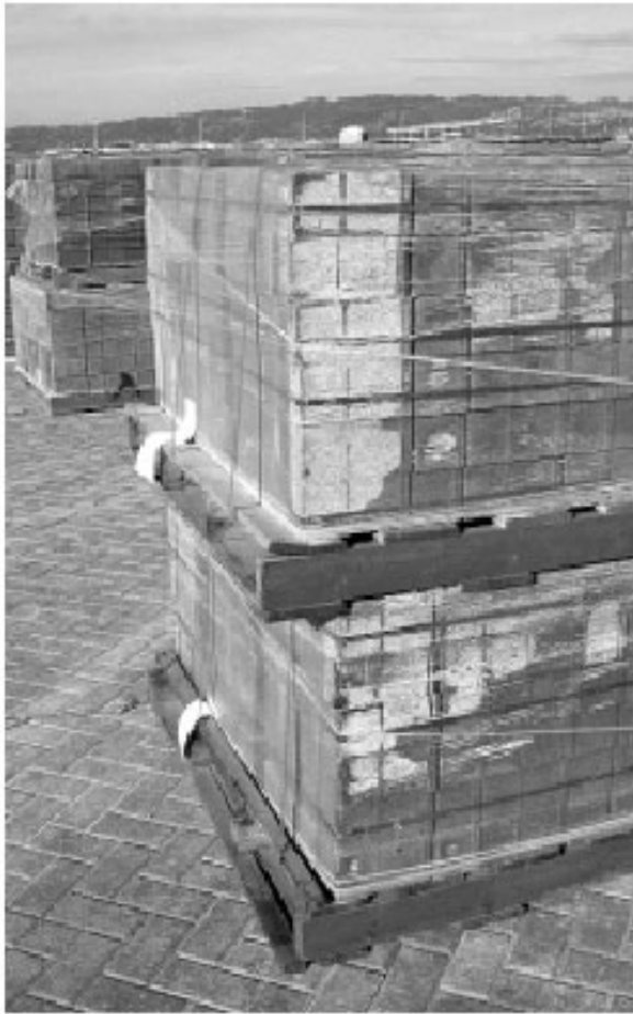
Figure 2. Bundles of ready-to-install pavers for setting by mechanical equipment. Bundles are often called cubes of pavers.