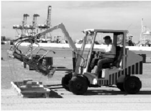
Figure 11. Sweeping jointing sand across the pavers is done after the initial compaction of the concrete pavers.