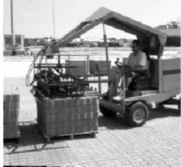
Figure 3. A cluster of pavers (or layer) is grabbed for placement by mechanical installation equipment. The pavers within the cluster are arranged in the final laying pattern as shown under the equipment.

Development and implementation of the Quality Control Plan is a joint effort by the project engineer, the GC, the paver installation subcontractor, material suppliers and testing laboratories.