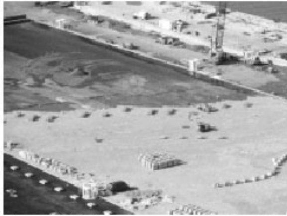
Figure 7. Maintaining an angular laying face that resembles a saw-tooth pattern facilitates installation of paver clusters.