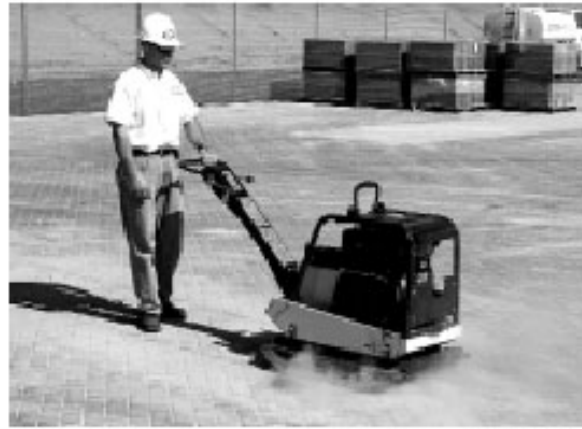
Figure 12. Final compaction should consolidate the sand in the joints of the concrete pavers.