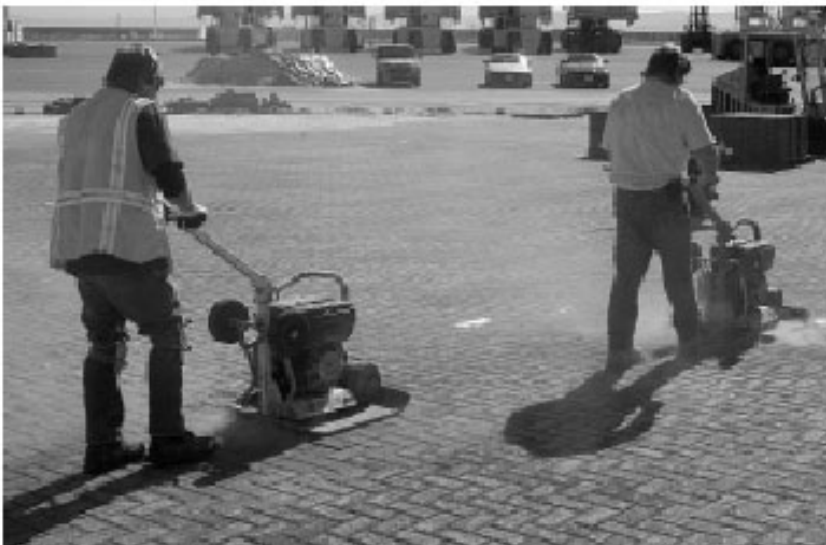
Figure 9. Initial compaction sets the concrete pavers into the bedding sand.