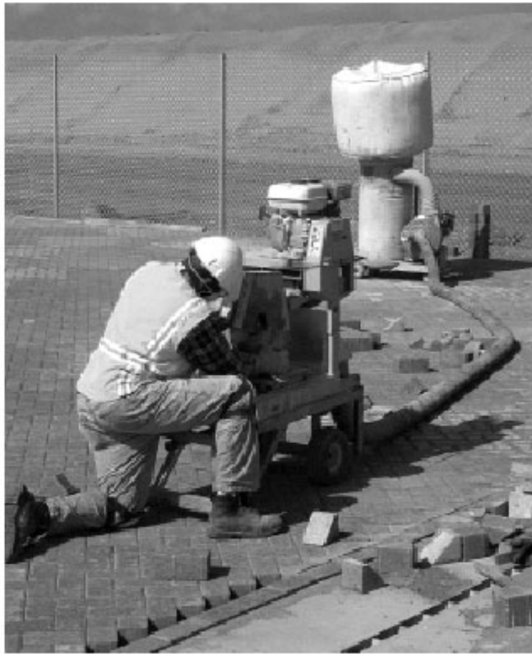
Figure 8. Edge pavers are saw cut to fit against a drainage inlet.