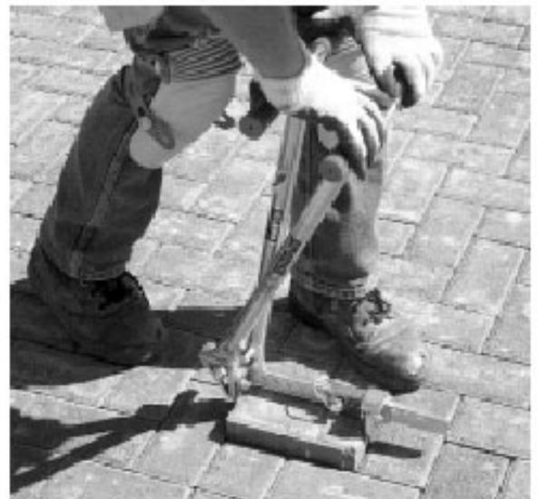
Figure 10. During initial compaction, cracked pavers are removed and immediately replaced with whole units.