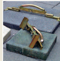
Small size SlabGrabber (4 to 16 inches)

Even the best worker can be slowed down by the wrong tools. Pavetech specializes in manufacturing tools for paver installers. To get up to cruising speed, here are some of our members' favourite Pavetech tools :